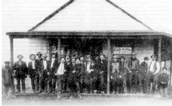
Basque shepherders. Nevada, al about 1910.