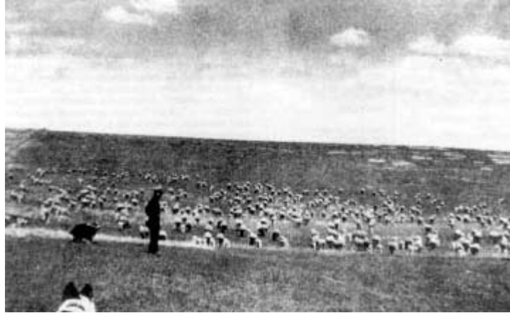
Basque shepherd. Montana.

In 1934, the United States Congress passed the Taylor Grazing Act, which placed an additional 173 million acres of land into federally controlled grazing districts. The new requirements for grazing on these public lands included paying fees and following a specified schedule for all of those using the land, but most importantly it originated the requirement that all of those wishing to use the federal lands had to establish a base property which they privately owned, in order to be eligible for the public lands grazing rights. Land allocation was determined by government officials and cattle ranchers serving on advisory boards- which were keen to deny access to the itinerant Basque sheepman. Now, Basques who migrated to the American west in search of quick riches and profitable sheep grazing were faced with long-term investments of having to purchase land. The Immigration Act of 1924 (limiting the annual number of Spanish nationals that could enter the United States), the economic Depression beginning with the stock market crash in 1929, together with the Taylor Grazing Act of 1934 curbed economic opportunities for Basques migrating to the United States, and though the flow from Euskal Herria decreased, it did not stop.